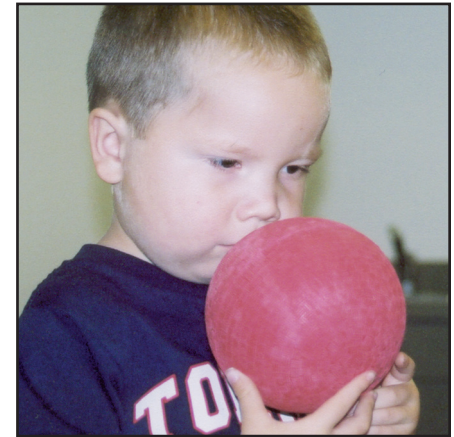
BIRTH TO AGE 3